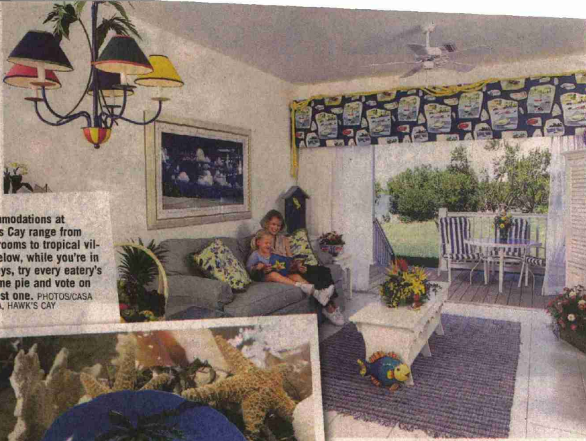
Accommodations at Hawk's Cay range from hotel rooms to tropical villas. Below, while you're in the Keys, try every eatery's key lime pie and vote on the best one.