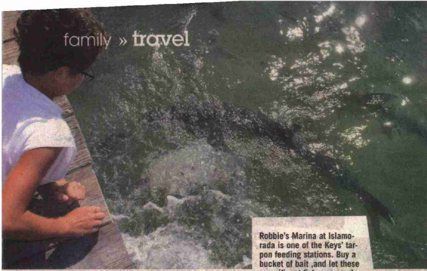
Robbie's Marina at Islamorada is one of the Keys' tarpon feeding stations. Buy a bucket of bait, and let these magnificent fish come and get it.

20th-century historic spots such as Harry Truman's Winter White House. It's a long drive to the end of the road, but because Key West also has air service and is a cruise ship stop, many visitors see it without driving the Overseas Highway.