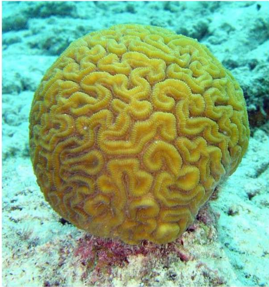
Measuring 10 feet by 16 feet, the world's largest piece of brain coral can be found at the popular diving and snorkeling spot Speyside.