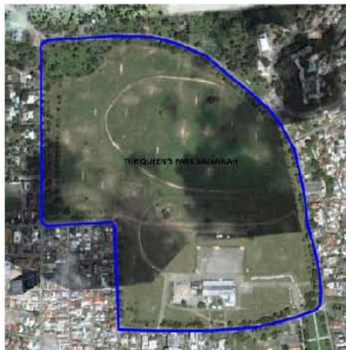
Trinidad and Tobago is home to the world's largest traffic roundabout around the Queen's Park Savannah.