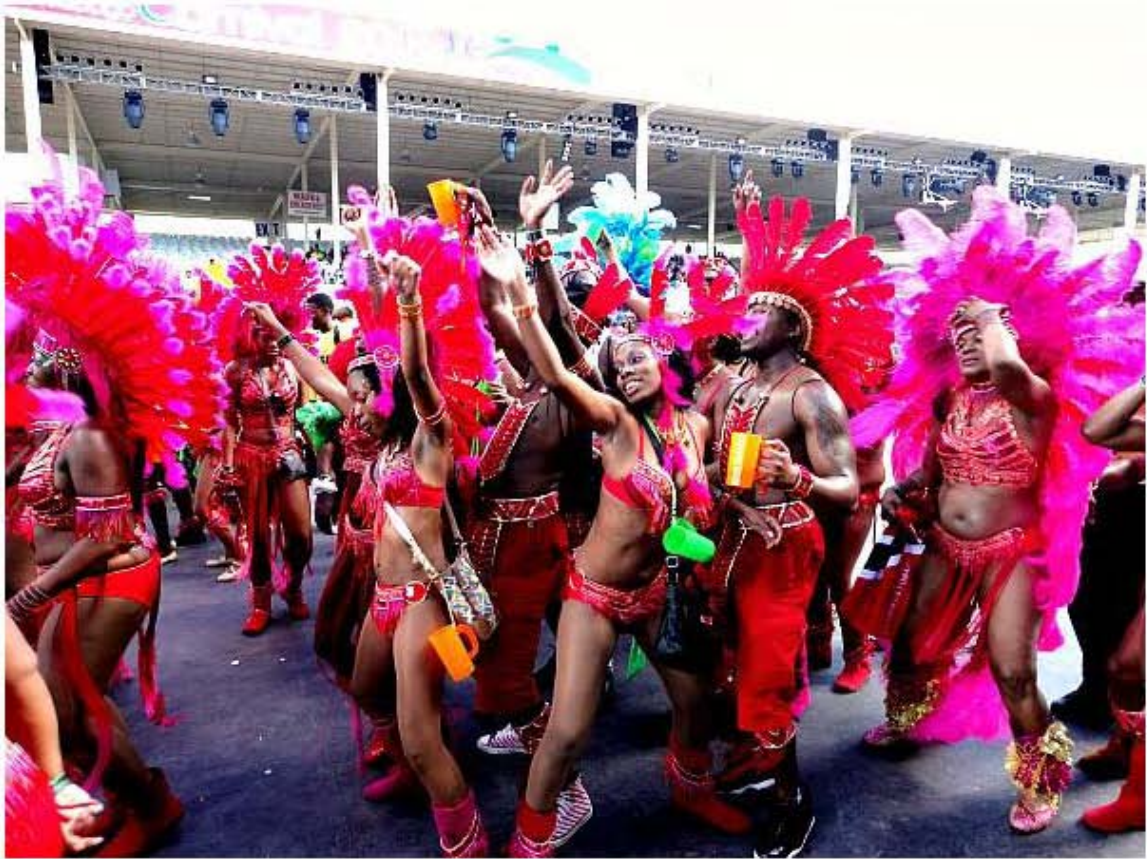
Trinidad is home to the largest Carnival in the Caribbean, which consistently ranks in the top 10 of most-coveted events in the world.