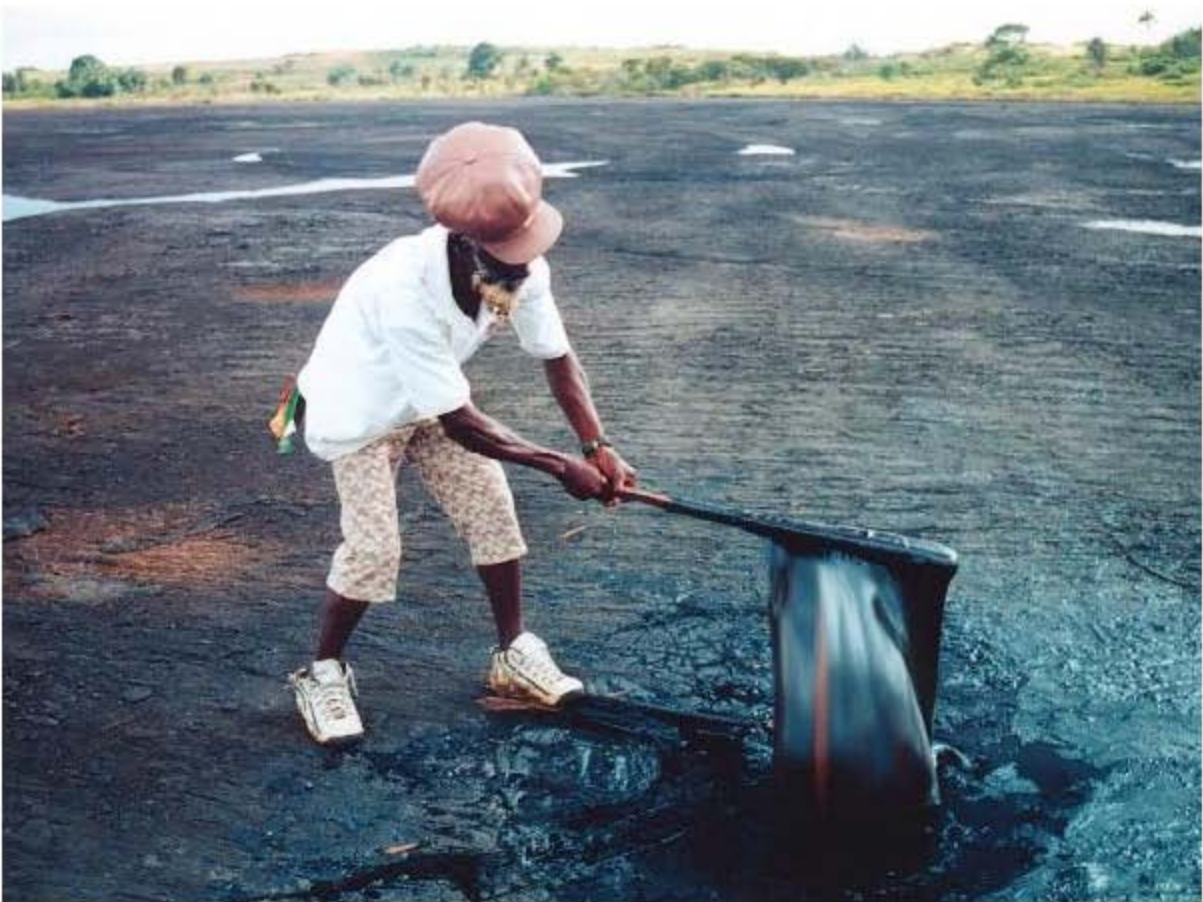
Pitch Lake in Trinidad is the world's largest natural deposit of asphalt. It covers about 99 acres and is 246 feet deep.