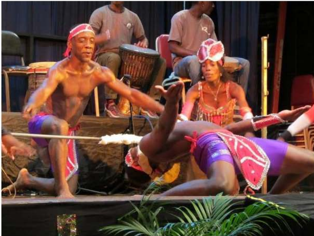
The Limbo dance was created in Trinidad.