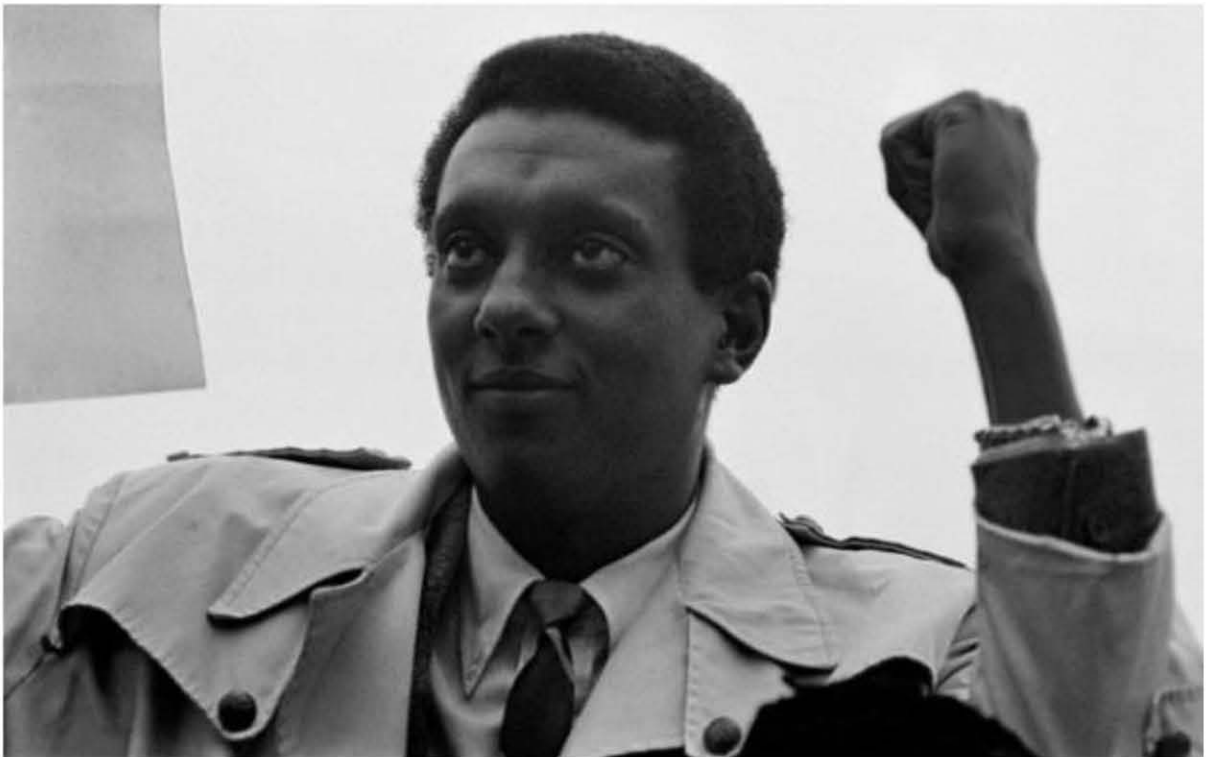
Trinidad and Tobago-born Stokely Carmichael (also known as Kwame Ture) was active in the U.S. Civil Rights Movement. He rose to prominence as the honorary prime minister of the Black Panther Party. He popularized the term "Black power" as a social and political slogan.