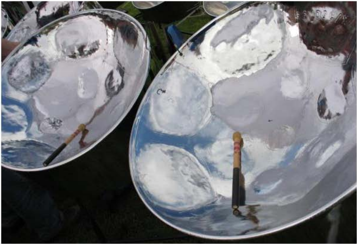
It is the birthplace of the steel pan drum.