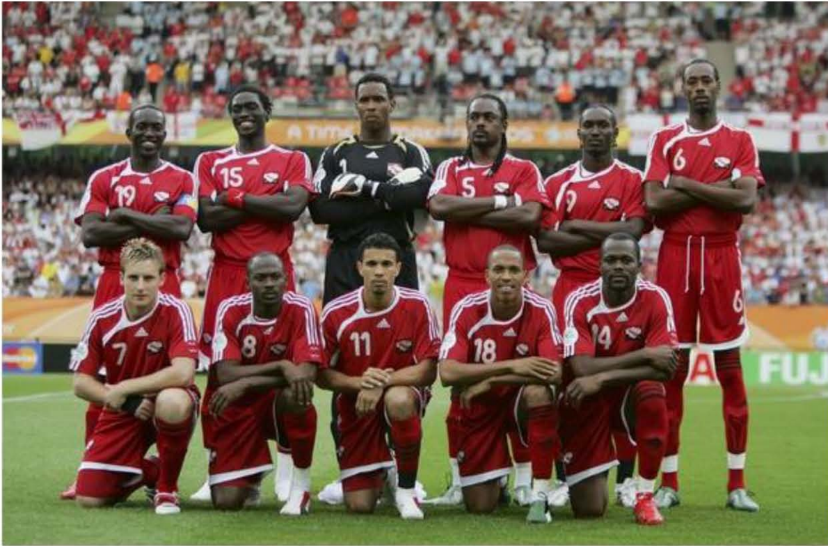
In 2006, Trinidad and Tobago became the smallest country ever to qualify for football's World Cup.