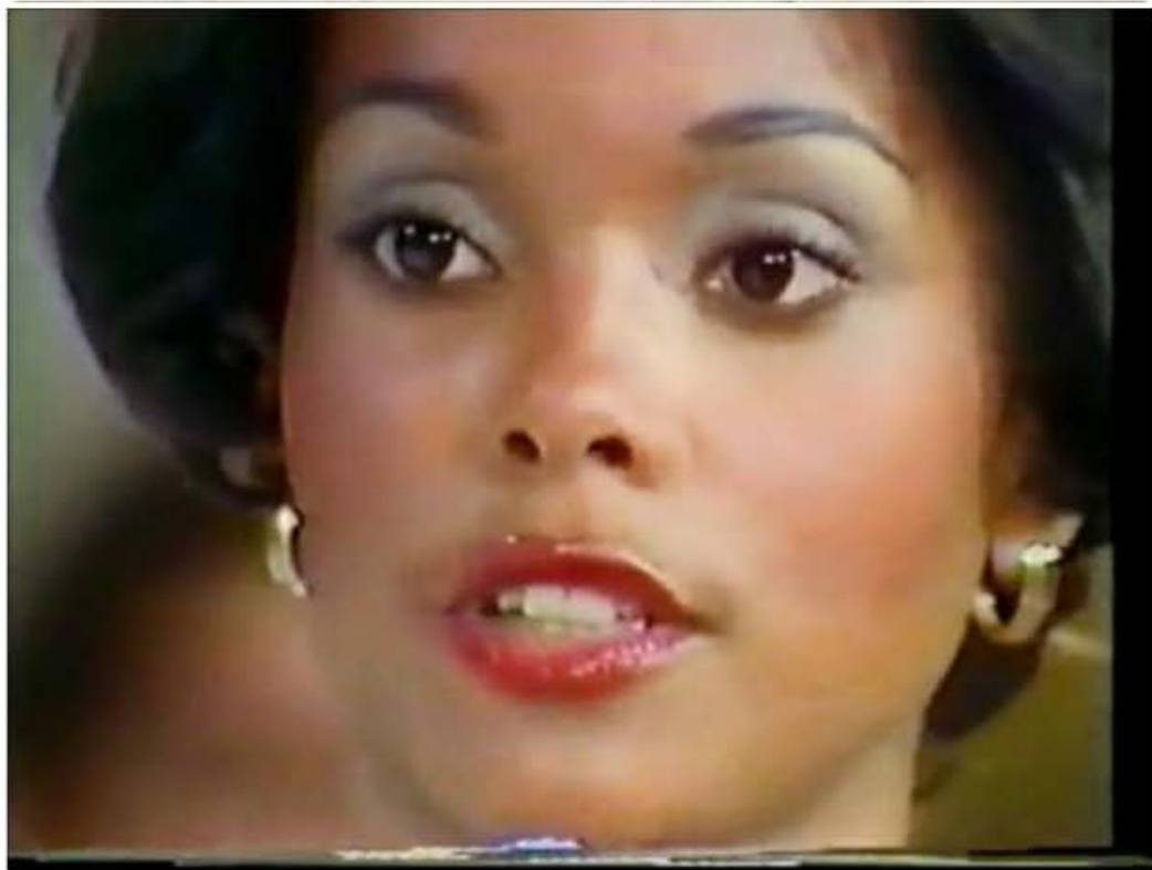
Janelle Commissiong, the first Black Miss Universe, is a Trinidadian and was crowned in 1977.