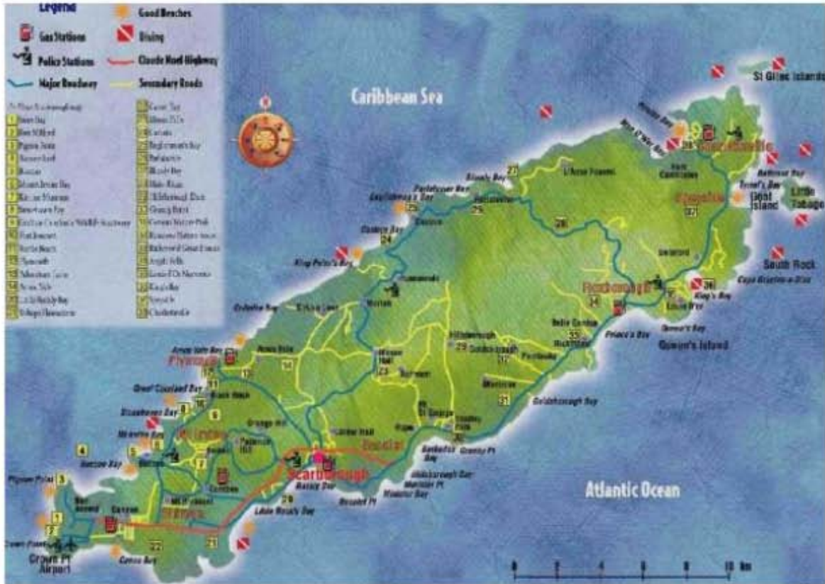
Tobago got its name because it resembles a tobacco pipe (tavaco) used by locals.