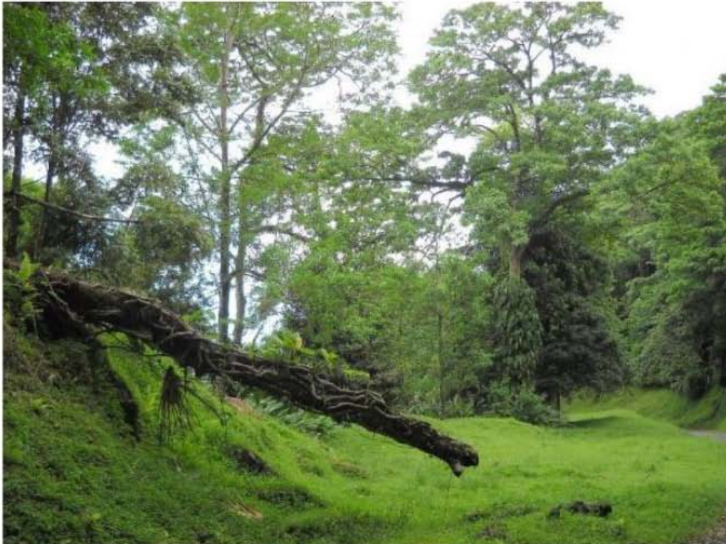
Main Ridge Forest Preserve on Tobago is the oldest protected rainforest in the Western Hemisphere.