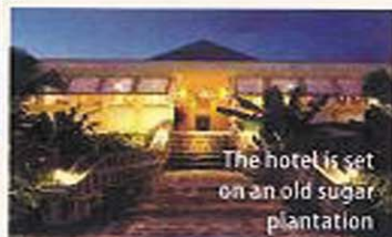
The hotel is set on an old sugar plantation

Nisbet Plantation Beach Club (00 1 869 469 9325, nisbetplantation.com), which has immaculate cottage-style rooms and palm-dotted lawns. Doubles in May cost from £351 including breakfast, dinner and afternoon tea.